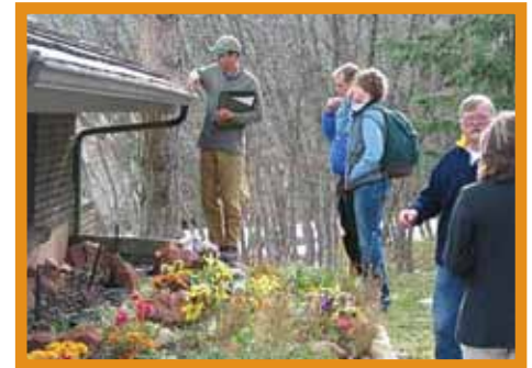
Figure 27: Sharing information and working with your neighbors and community will give your home and surrounding areas a better chance of surviving a wildfire.