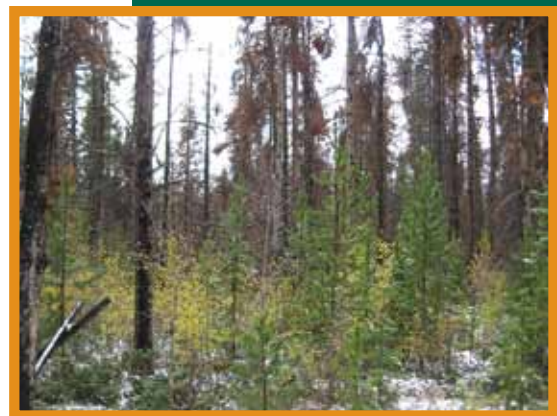
Figure 23: A young lodgepole pine stand. Thinning lodgepole pines early on in their lives will help reduce the wildfire hazard in the future.