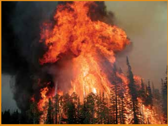
Figure 3: Burning embers can be carried long distances by wind. Embers ignite structures when they land in gaps, crevices and other combustible places around the home.

Heavier fuels, such as brush and trees, produce a more intense fire than light fuels, such as grass. However, grass-fueled fires travel much faster than heavy-fueled fires. Some heavier surface fuels, such as logs and wood chips, are potentially hazardous heavy fuels and also should be addressed.