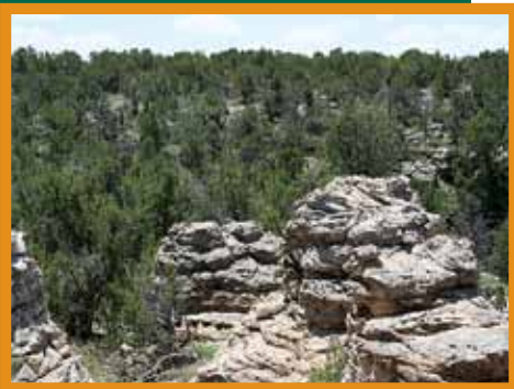
Figure 24: Piñon-juniper forests are often composed of continuous fuels. Creating clumps of trees with large spaces in between clumps will break up the continuity.

Note: This publication does not address high-elevation spruce-fir forests. For information on this forest type, please contact your local CSFS district office.